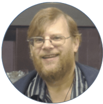
Arm River Steve Forbes