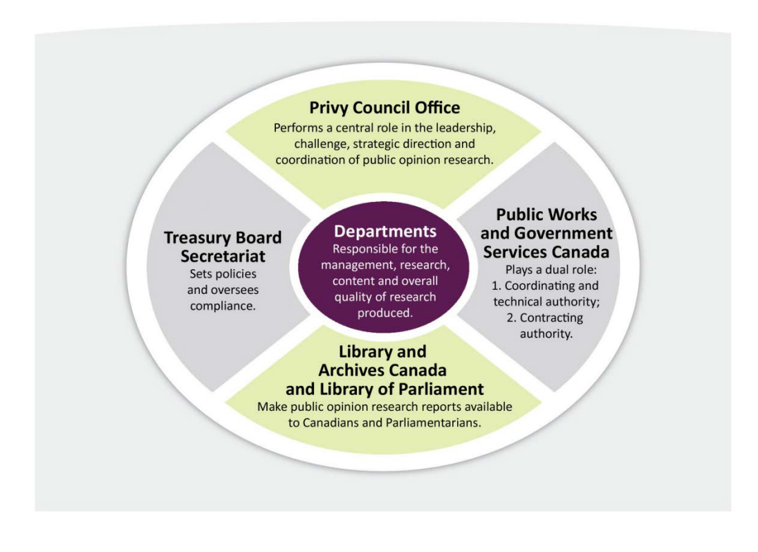
Figure 2: Organizations with a Responsibility for Public Opinion Research

The <u> Communications Policy of the Government of Canada </u> assigns the following responsibilities to key bodies in public opinion research. (See Figure 2.)